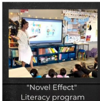
"Novel Effect" Literacy program