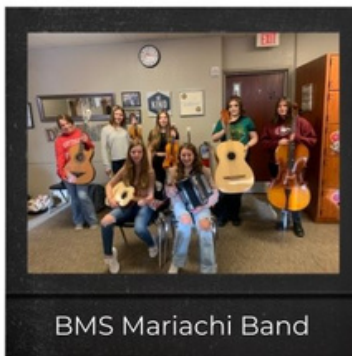
BMS Mariachi Band

Classroom Grants make a BIG impact across the district.